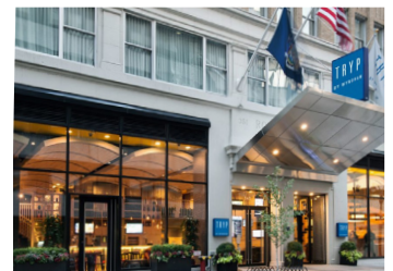
Tryp by Wyndham Times Square, NYC