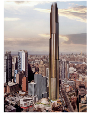
9 Dekalb Avenue Brooklyn, NY