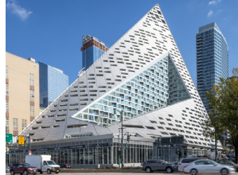
625 W 57th Street New York, NY