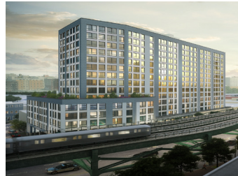
1325 Jerome Avenue Bronx, NY