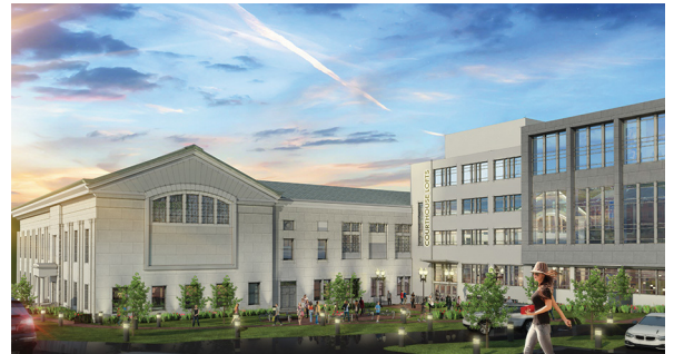
Courthouse Lofts, Worcester, MA