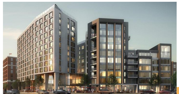
Cambria Hotel, Boston, MA