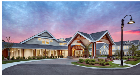
Maplewood at Brewster, Cape Cod, MA