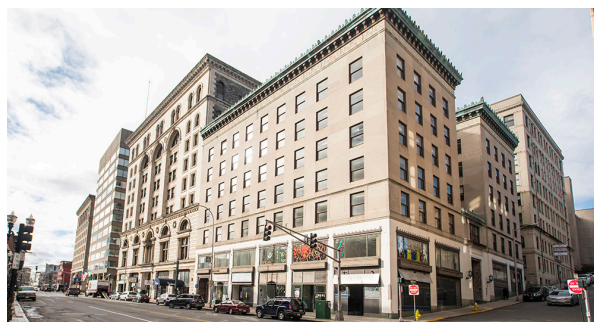
The Central Building, Worcester, MA