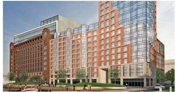
Lovejoy Wharf, Boston, MA