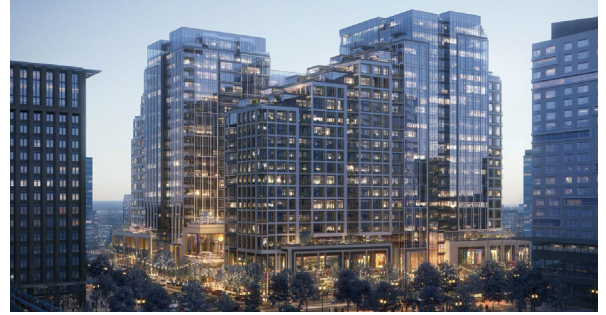
Seaport, Boston, MA