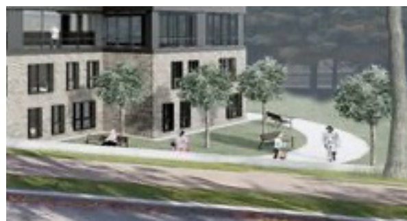
Golda Meir House, Newton, MA