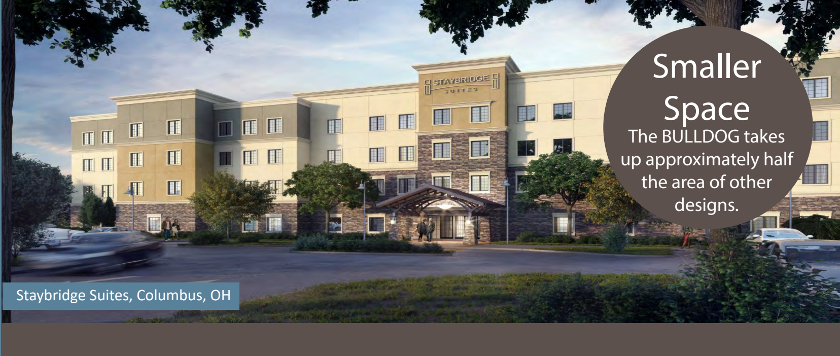
Staybridge Suites, Columbus, OH

Smaller Space The BULLDOG takes up approximately half the area of other designs.