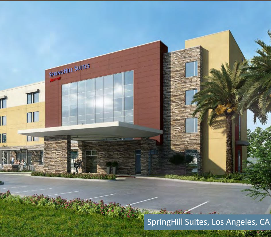
SpringHill Suites, Los Angeles, CA

Smaller Space The BULLDOG takes up approximately half the area of other designs.