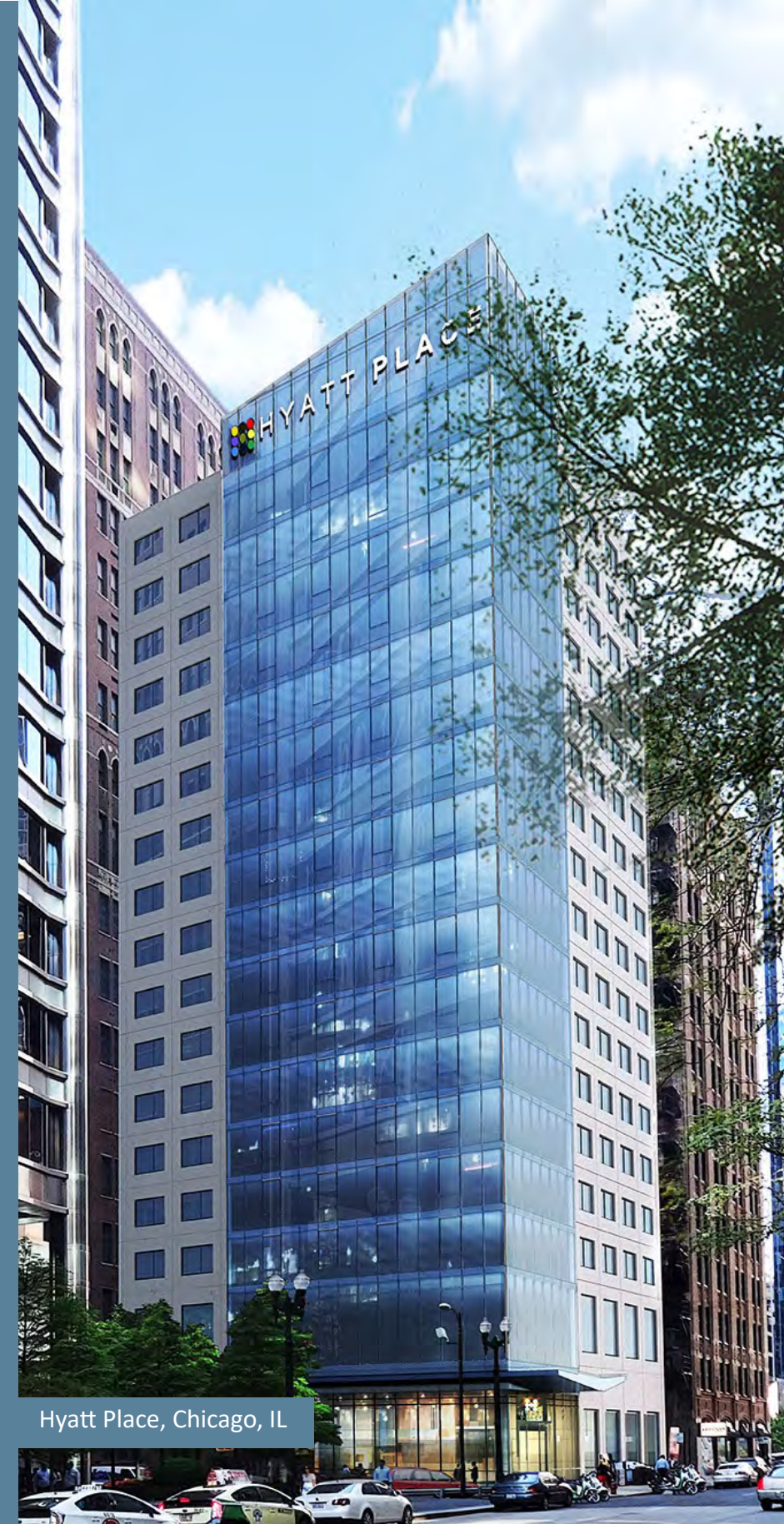
Hyatt Place, Chicago, IL

CGC Group 1-150 Britannia Rd. East, Mississauga, Ontario, Canada, L4Z 2A4 T: 1-888-220-5551 www.cgc-group.com www.bulldogheatpump.com