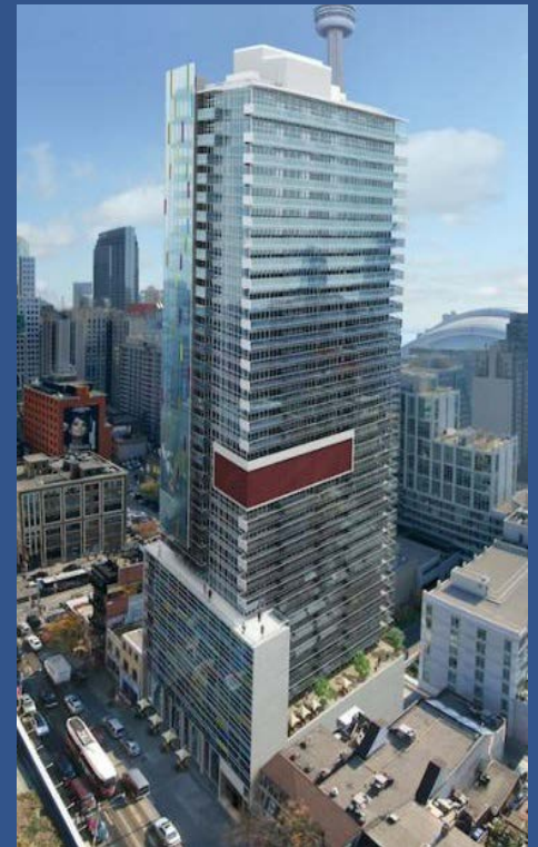
M5V - Toronto