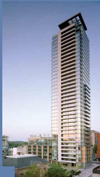
18 Yorkville - Toronto