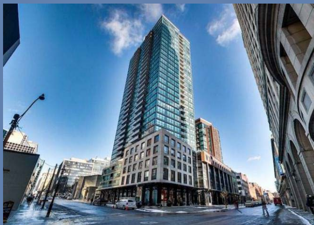
London Lofts - Toronto