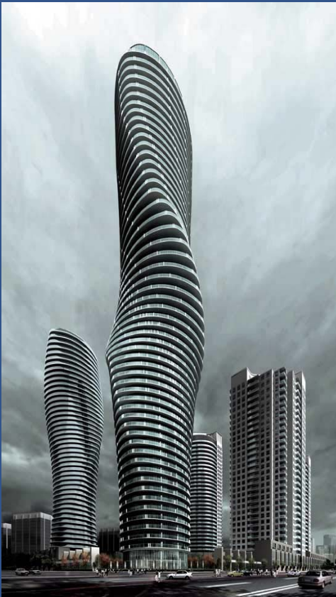
Absolute World - Mississauga